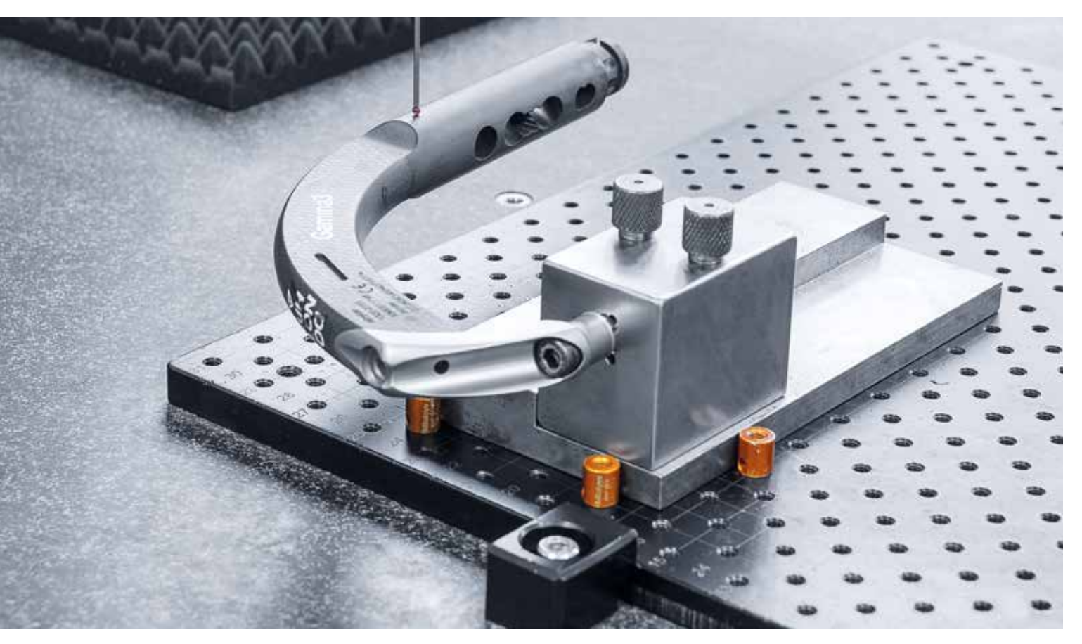
Lightweight hybrid construction for trauma surgery: The target device for intramedullary nailing produced by Moll Engineering for Stryker permits a precise, secure screw attachment to the fractured femur. The tolerances of medical technology products are often in the range of a thousandth.

The acquisition of Moll / Wenglon complements Ensinger's medical technology portfolio