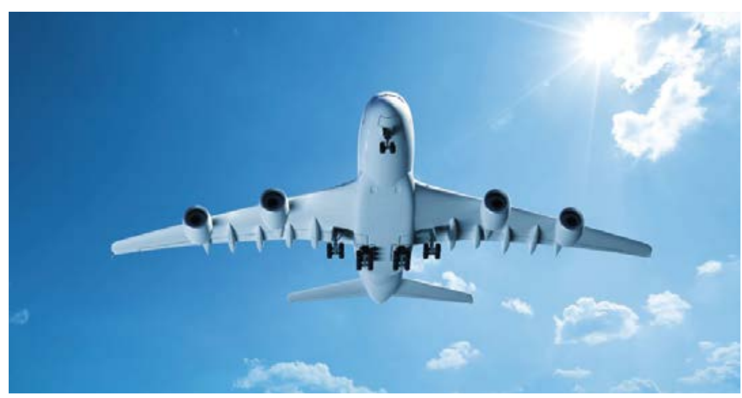
Modern materials for aircraft construction quarantee maximum safety coupled with low weight.