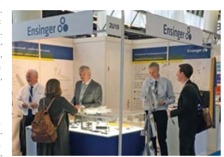
The trade fair stand at the "Aircraft Interiors" in Hamburg. The ideal alternative to metals and glass, plastic products combine low density with high thermal and

ing four company divisions at the show for the first time: Stock Shapes, Machined Parts, Industrial Profiles & Tubes and Injection Moulding. Where special customer requirements are involved, the divisions also call on the support and experience of the Compounds Division.