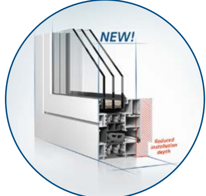
A minimized profile without compromising insulating performance; how to reduce the overall depth of windows, doors and facades

With a thermal conduction coefficient λ of just 0.18 W/m•K, the new insulating profile LO has the usual smooth, compact exterior. The key to its even greater insulating efficiency is its porous core: the glass fibre reinforced polymer blend (PA 66 and PPE) contains microscopically small, closed cavities. This special structure is patented by Ensinger. The insulating properties are improved and the insulating bar is also lighter than a solid profile. The requirements of DIN EN 14024 regarding transverse tensile strength and shear strength are fulfilled (test report by the ift Rosenheim). insulbar LO is precisely moulded and available in the conventional geometries as well as in individual designs and styles. The variant LEF for example, assisted by a Low-e film on the flags of the profile, reduces energy losses through heat radiation to a minimum. Capable of being processed in the normal way, insulbar LO also permits anodisation and powder coating in the finished assembly.