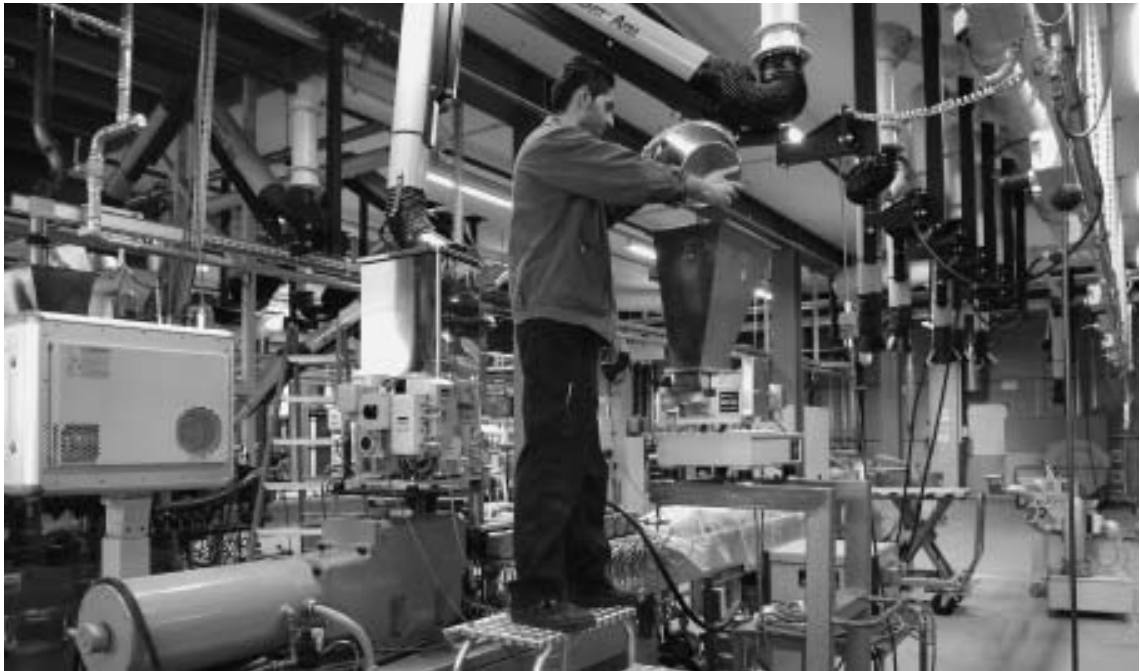
In the new Compounding Division production area