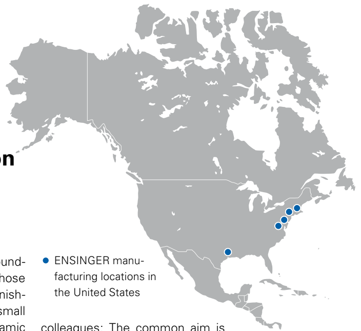
● ENSINGER manufacturing locations in the United States