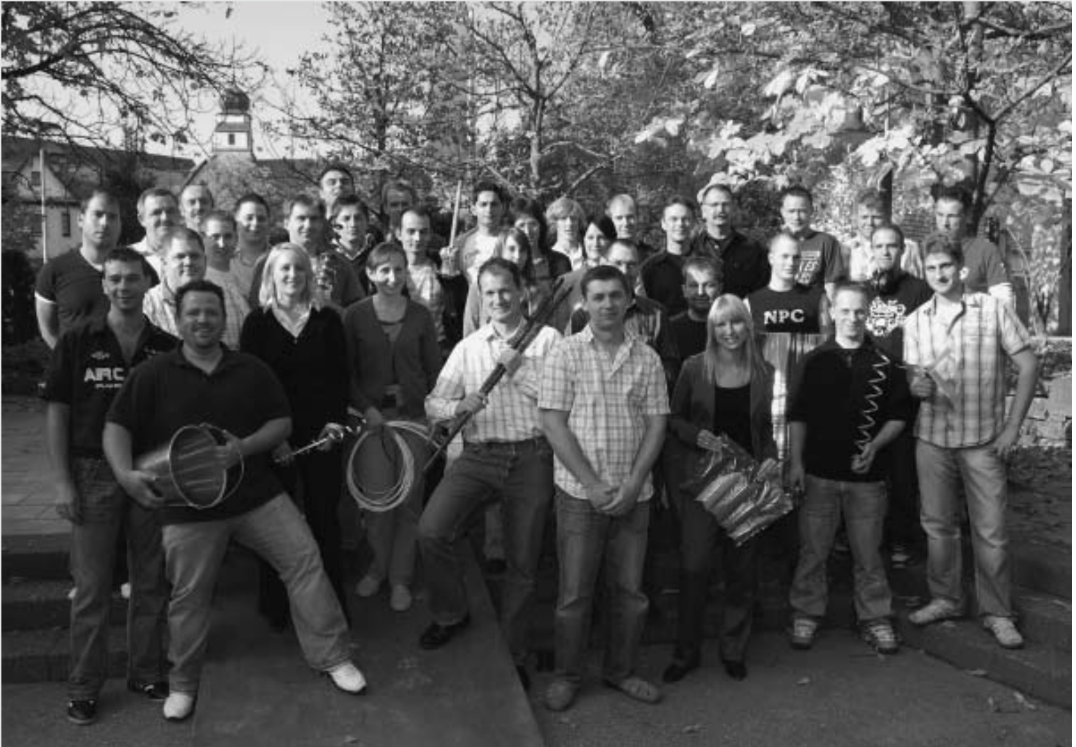
Theme: ENSINGER Compound Division – Move to a new factory site