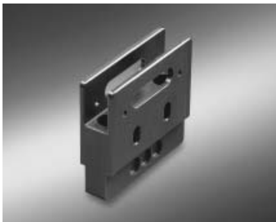
Insulator from TECASINT 2000

TECASINT 5000 (previously known as: SINTIMID PAI) is a non-thermoplastic processable high-temperature polyamide. The sintering material is particularly suitable for applications in semiconduc-