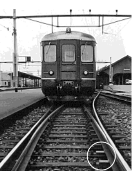
Diagonally to the gliding direction there are notches that drain off wear dust and dirt

tribological and dynamic controls on ENSINGER test equipment used for the continual improvement and optimisation of the technique