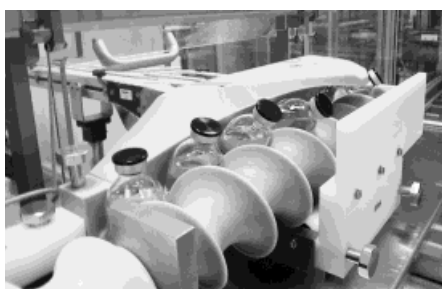
Transport screw produced from TECAGLIDE

The green colour is typical for this material. Together with excellent gliding and friction properties, TECAGLIDE has a very good stick slip behaviour and is resistant to many oils, greases and fuels. The material is able to withstand very high temperatures, it is tough, wear resistant,