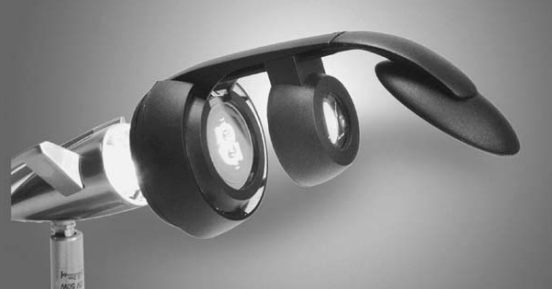
GoboTop® with deflection mirror

The plug was machined from ENSINGER high performance plastic TECAPEEK GF. TECAPEEK GF is a glassfibre-reinforced material with high strength which has the best properties for this application: an extraordinary dimensional stability over a wide temperature range and a low tendency to creep for parts with tight tolerances. Even under high tension TECAPEEK insulates electrically. Since the system plug is individually inserted for each test procedure, the excellent sliding-properties and especially the permanent wear resistance of the material is critical. By machining, the material can be processed with the highest precision. Because of its extraordinary properties, the high performance plastic TECAPEEK GF 30 is used in electrical engineering, in medical technology, in mechanical engineering and in aviation and aerospace engineering.