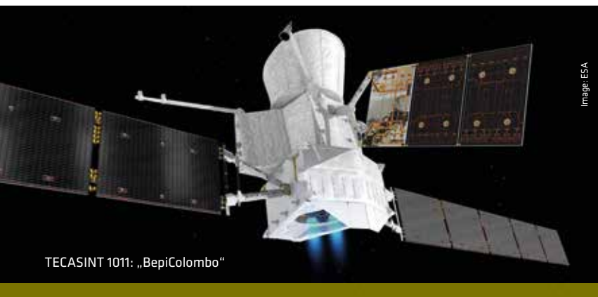
TECASINT 1011: „BepiColombo“