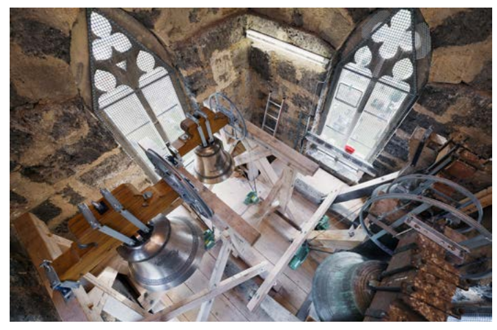
The Martha bell and the Meinrad bell complete the peal in the Sülchenkirche. The two old bells (right half of image) date back to the years 1682 and 1727.

New bells for Rottenburg's Sülchenkirche