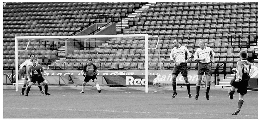
Full power from both sides, VICTREX beat ENSINGER 4:1

Of course, the VICTREX company had more to offer the ENSINGER players than just football. After the official welcome on Friday evening, the first move on the Saturday morning was to Lancashire, where