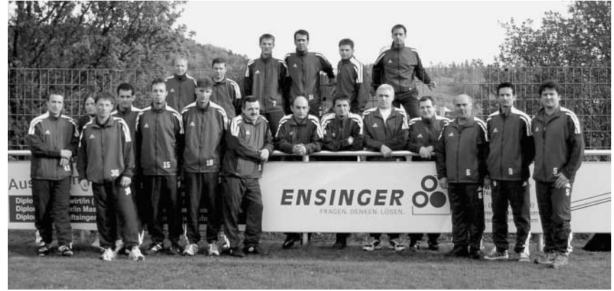
The ENSINGER football team in their new tracksuits