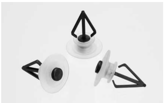
Paint plugs for aluminium band rims

temperature of 220°C. However, the paint significantly reduced the friction of the wheel nuts on the conical surfaces of the holes. ENSINGER's injection moulding division developed a product with which the conical surfaces can be kept free of paint. The result is the "paint plug", which is produced in a two-com-ponent process. The number of process steps is thus reduced to a minimum. The component consists of two parts: a seal made of TPE (thermoplastic elastomer) and a clip made of TECAMID 66 GF35. The clip snaps into the holes for the wheel nuts, and thus sits firmly for the entire duration of the process