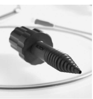
PercuTwist Dilatator made of TECAPEEK MT blue

Rüsch GmbH has now put a new. patented product for tracheotomy on the market - the PercuTwist Dilatator. When the PercuTwist Dilatator is inserted in the windpipe, the patient can be respirated through the windpipe. The advantages of the product lies in the novelty of the process itself. The opening of the windpipe is effected from the outside by means of a self-cutting thread. This is the least disruptive method possible for the patient. There are none of the otherwise common complications that can be expected with traditional tracheotomy. The new hydrophilic coating of the thread eases insertion in the windpipe, and thus reduces the force required – which gives greater accuracy and control. Rüsch GmbH offers doctors and hospitals a kit that includes all the instruments needed to carry out a tracheotomy, in addition to the PercuTwist Dilatator itself.