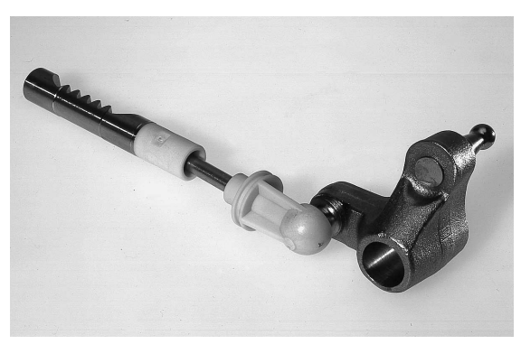
Rack for LuK: The two ball-and-socket joints made of TECAMID GF25 TF10mod. were cast directly on to the parts in a single production cycle by ENSINGER, using two-component

One of the elements connecting the electric motor and the vehicle's gearbox is the rack. This part must be capable of transmitting high forces in either direction. Because of the internal construction of the gearbox actuator, the shift mechanism requires a compensating connector. This is the area between the two ball-and-socket joints of the rack, which is made of the structural plastic TECAMID 66 GF25 TF10 mod. This glass-fibre reinforced, semi-crystalline polyamide is remarkable for its extreme hardness and dimensional stability. This low-wear plastic can be used at constant operating temperatures of up to 110°C, and is therefore particularly suitable for heavily loaded and heat-stressed parts. The ball-and-socket joints are die-cast directly on to the component in one production cycle, thus joining the connector to the rack. The use of two-part technology reduces the