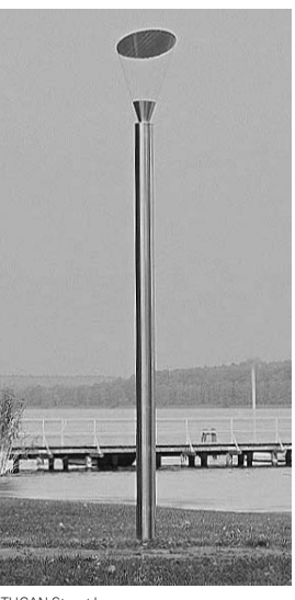
TUCAN Street Lamp

A street lamp that is innovative in design and economical of all resources: that's what uwe braun gmbh in Lenzen on the Elbe have put on the market. TUCAN is the name of the lamp that was designed by the office of Eckes:Design GbR - and which won them the Design Prize of the State of Brandenburg.