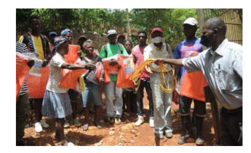
The sturdy plastic tarpaulins are 10 meters long and have the quality of truck tarps.

"Pwojè men kontre" trains local farmers in sustainable agricultural techniques and pays for a place in a hostel for young people starting an apprenticeship or a course of studies.