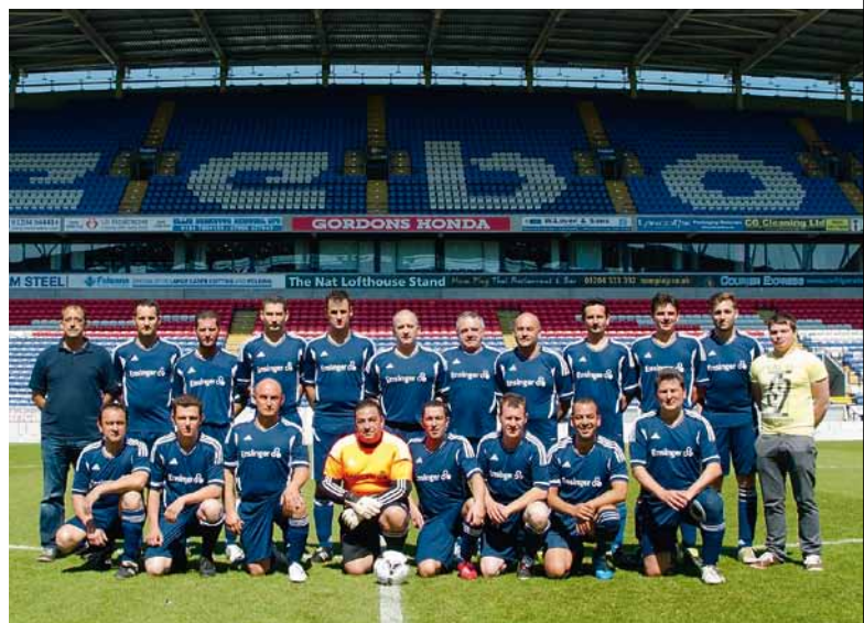
Das Erstligastadion der Bolton Wanderers fasst 30.000 Zuschauer

until the next Victrex football cup takes place. The teams spent Sunday morning in Liverpool with a joint visit to the Beatles Museum, before the flight back to Germany – where both the entertaining and successful visit to our English colleagues came to an end.