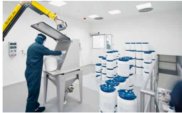
Loading station in the upper floor of the clean room

duction. Quality control procedures and extensive technical documentation are an essential component of these projects. A further major focus of work of this department is the production of highly purified materials used as implants. In order to compound these pro-