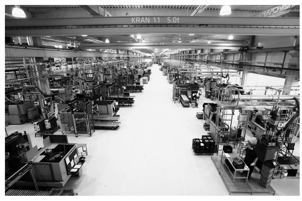
Tidied up: The 150 metre long production and processing hall

[JF] The new injection moulding factory in Rottenburg-Ergenzingen has now been in operation for nine months. Before this, the division was located in Nufringen, where there was no longer space for expansion. The new, ground-level factory excels with its transparency, short distances and energy efficiency.