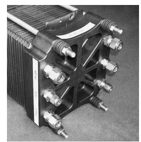
A prototype of a fuel cell was used at K 2004. The end-plates are made of TECATRON® PPS and were produced by the ENSINGER Cutting Operations Division.

However, the development engineers are not ready to give up yet: Large portions of the fuel cell can be produced in the future using high-tech polymers instead of metal. In bipolar plates they replace gold-coated stainless steel, aluminium, graphite or Duroplast-graphite mix-