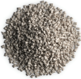
Granules TECACOMP PEEK MED LDS grey

The light gray inherent color of TECACOMP PEEK MED LDS grey also meets the requirements of the medical industry for a clear light color of the products TECACOMP PEEK MED LDS grey is available as granules or can also be supplied as film down to a minimum thickness of 100µm via our partner LITE GmbH.